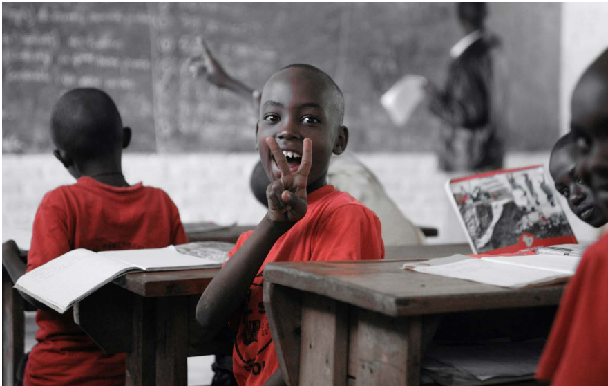
School time in Uganda.

Link to PLURA homepage: https://www.africamultiple.uni-bayreuth.de/en/Public-outreach/PLURA/index.html